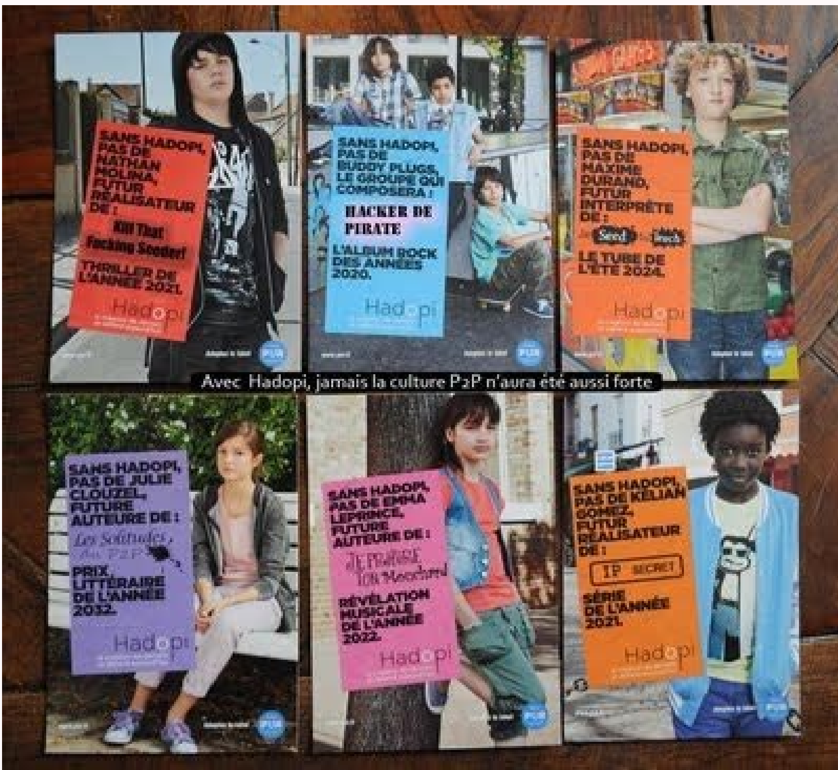
Avec Hadopi, jamais la culture P2P n'aura été aussi forte